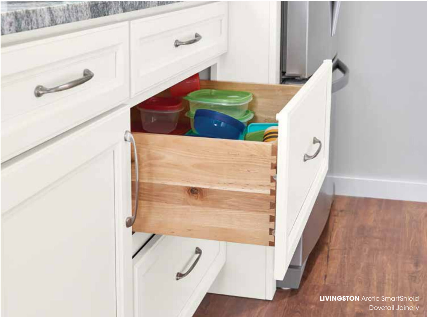
LIVINGSTON Arctic SmartShield Dovetail Joinery